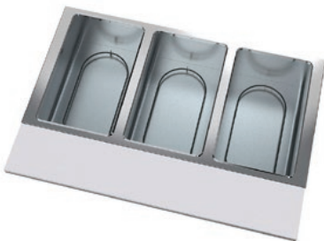
*Top view of HT-3W-120(B)

Add Water Pans (HT-1P), an Overshelf & Casters to your Hot Food Counter! (See Page 9 or 130)