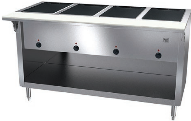
*Enclosed Base Model (HT-4W-120B)

Add Water Pans (HT-1P), an Overshelf & Casters to your Hot Food Counter! (See Page 9 or 130)