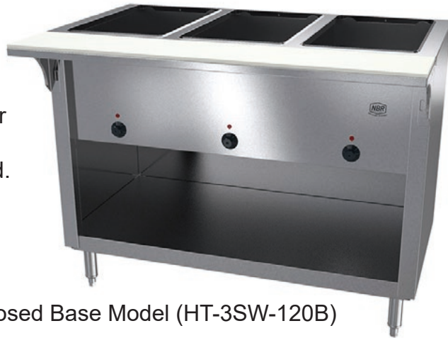
*Enclosed Base Model (HT-3SW-120B)