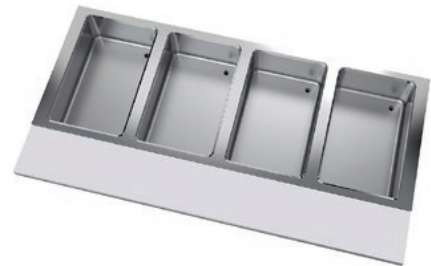
*Top view of HT-4SW-240(B)