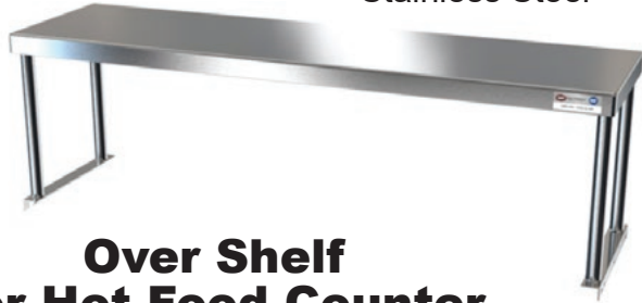
Over Shelf For Hot Food Counter